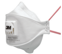
3M™ Aura™ Particulate Respirator 9332+