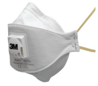
3M™ Aura™ Particulate Respirator 9312+