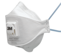
3M™ Aura™ Particulate Respirator 9322+