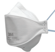
3M™ Aura™ Particulate Respirator 9320+