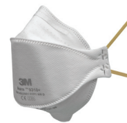
3M™ Aura™ Particulate Respirator 9310+