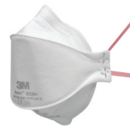
3M™ Aura™ Particulate Respirator 9330+